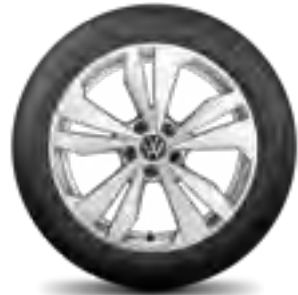
"Loen", 19, 20-inch Brilliant Silver