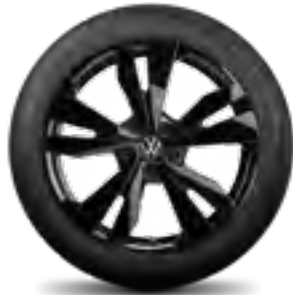
"Loen" 20-inch Black

Further accessories for your wheels, including valve caps, wheel bolt locking sets, tyre bag sets and snow chains, can be found in the universal accessories section on page 51.