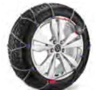
Snow chains for the ID.4